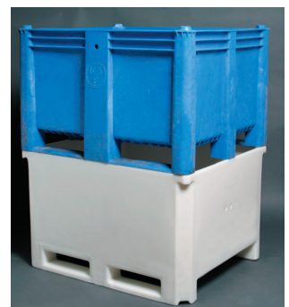
The Sæplast 600L is specially designed to inter-stack with Dolav box-pal type 1000 containers.