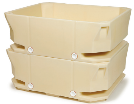
When stacked, the upper tub works as a seal on the one below.